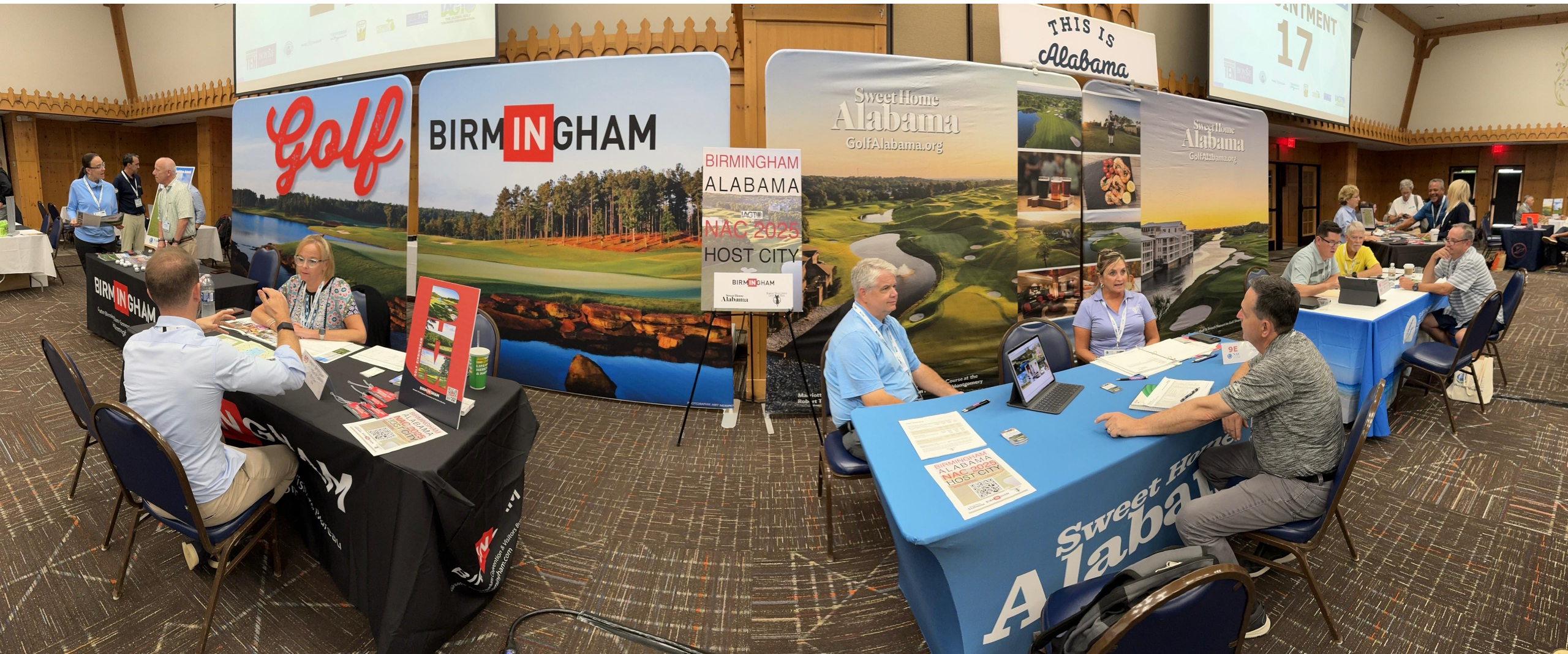
IAGTO North American Golf Tourism Convention (NAC 2025) Birmingham, June 17-20, 2025